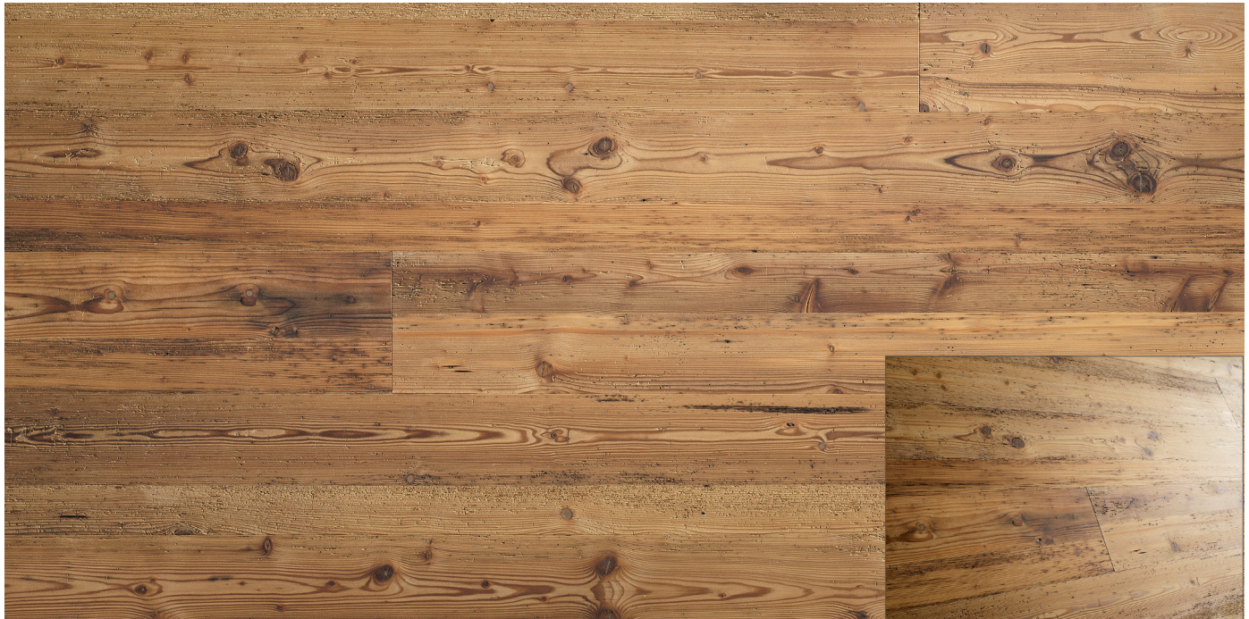
The above picture shows an example of the natural character of the wood, this will vary in every panel.

Bottom layer: softwood, without special quality specification.