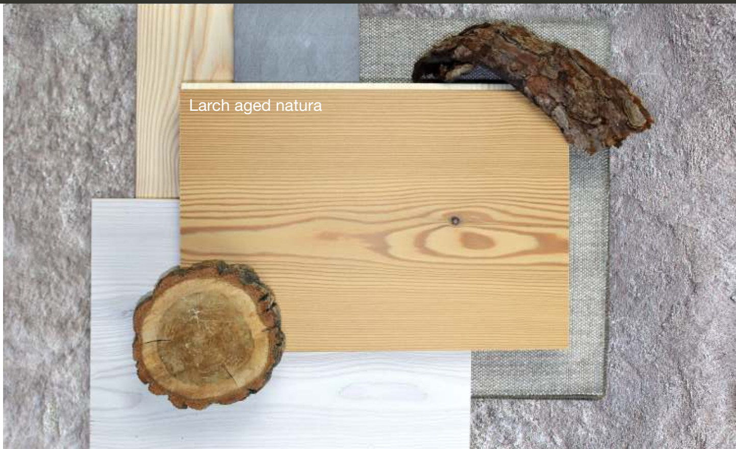
Larch aged natura