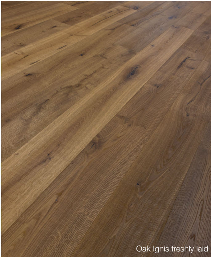
Oak Ignis freshly laid

Admonter flooring is a 100 % natural product. A picture is never a substitute for the „real thing“. For this reason we recommend a visit to your nearest Admonter flooring dealer. He will be pleased to show you samples.