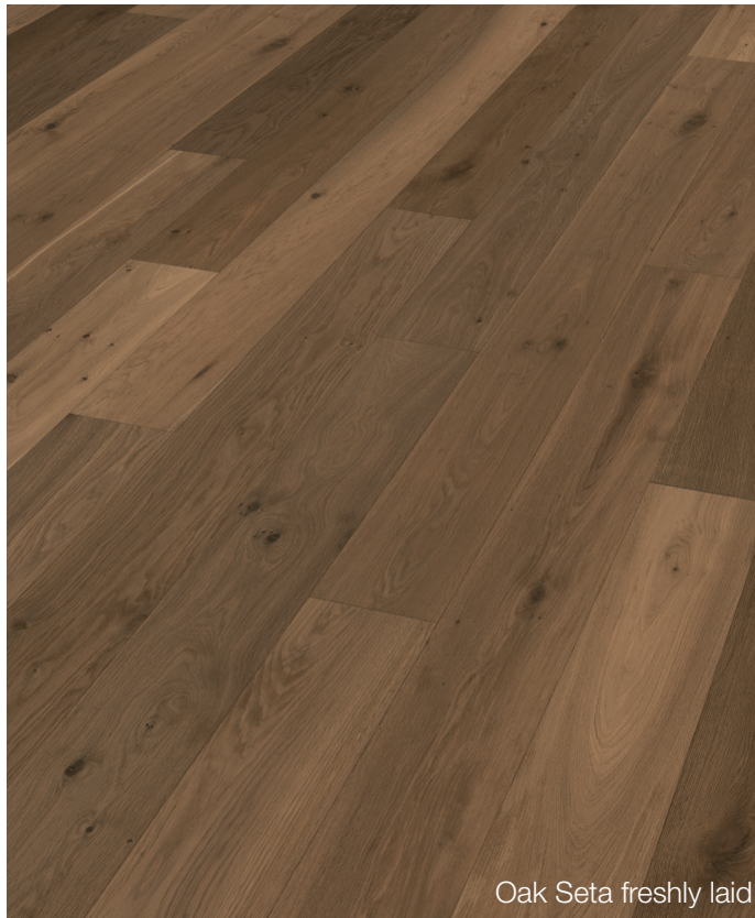
Oak Seta freshly laid