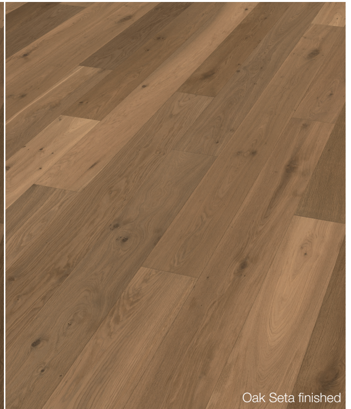
Oak Seta finished

Admonter flooring is a 100 % natural product. A picture is never a substitute for the „real thing“. For this reason we recommend a visit to your nearest Admonter flooring dealer. He will be pleased to show you samples.