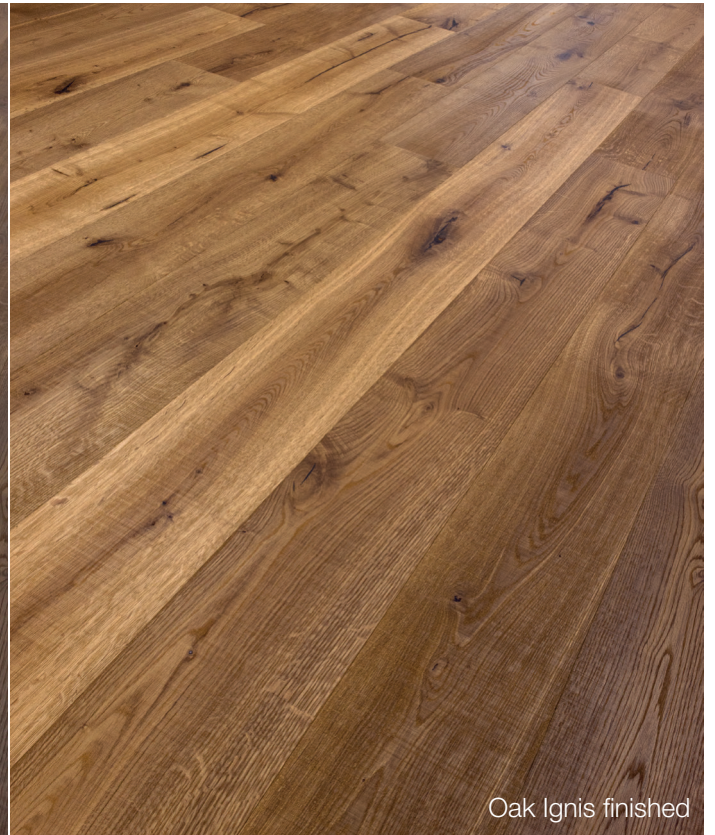
Oak Ignis finished