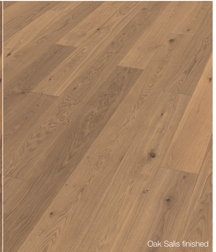
Oak Salis finished