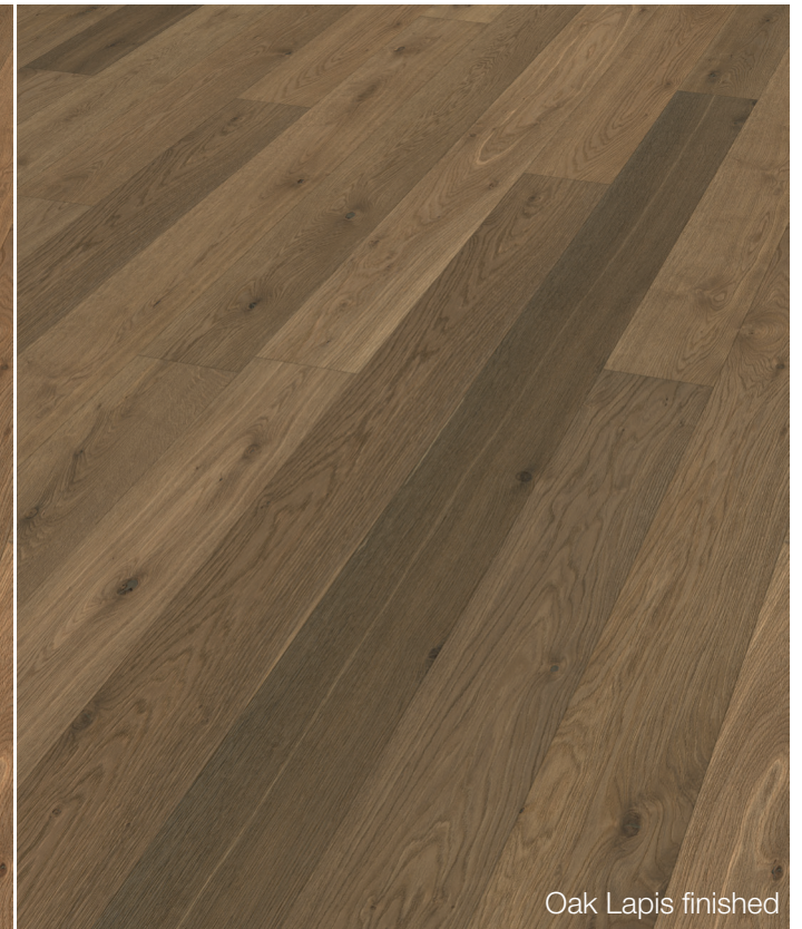
Oak Lapis finished