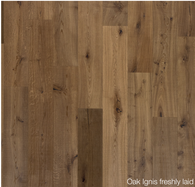
Oak Ignis freshly laid