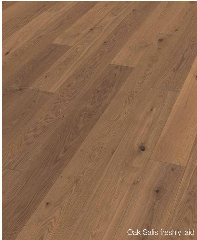
Oak Salis freshly laid