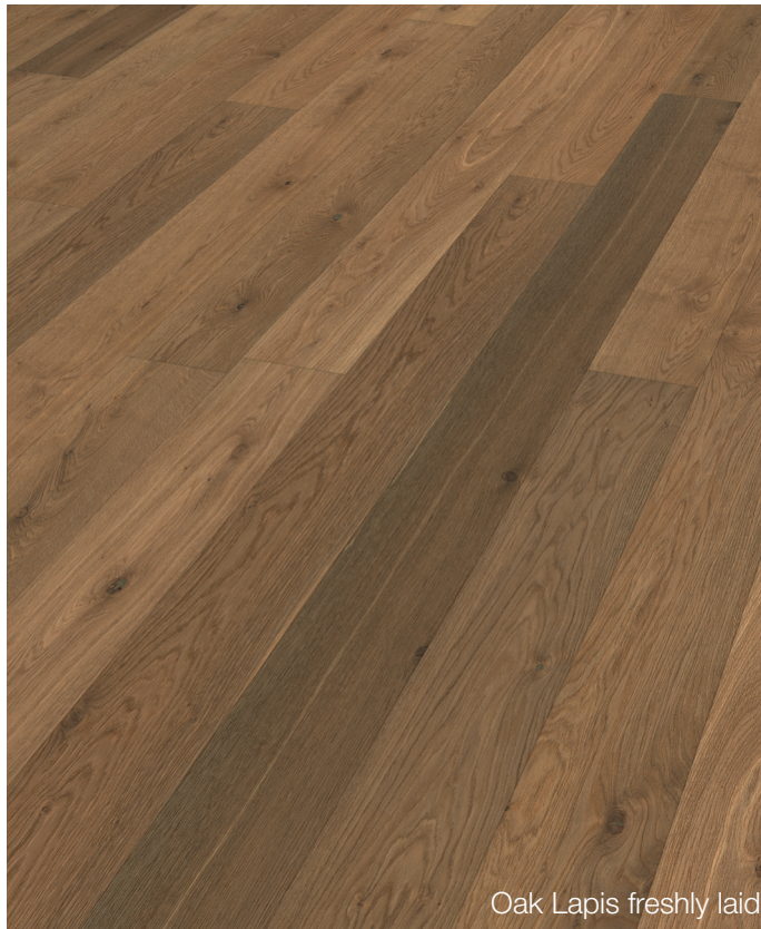
Oak Lapis freshly laid