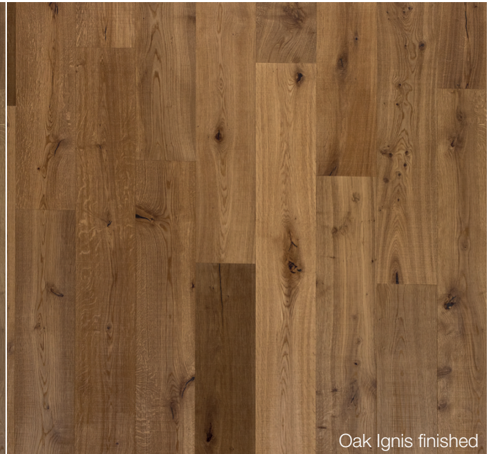
Oak Ignis finished