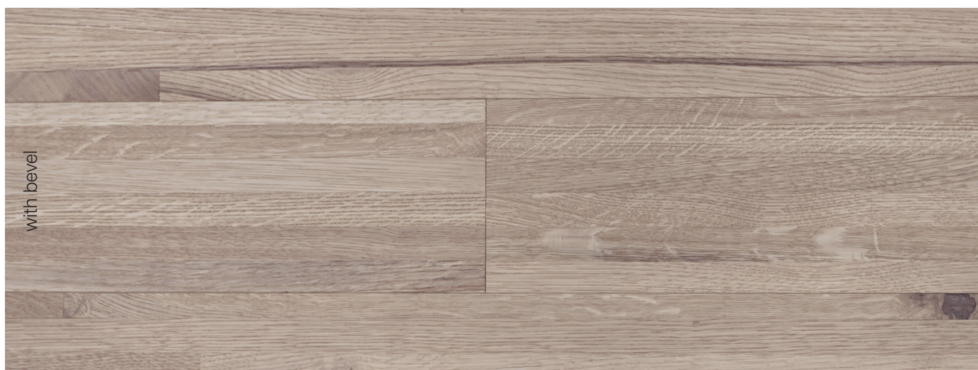
The illustrations are a guide to the appearance of the grading.