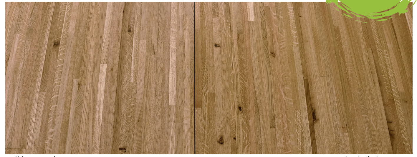
matt lacquered natural oiled easy care

Surface finishes in comparison: same colour but different appearance