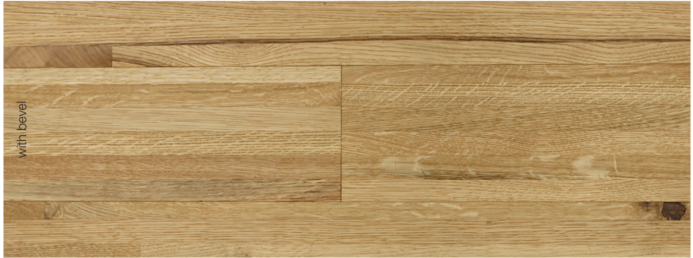
The illustrations are a guide to the appearance of the grading.