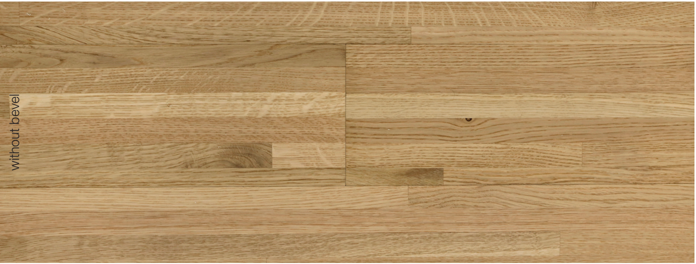
Admonter flooring is a 100 % natural product. A picture never replaces the reallity. For this reason we recommend a visit to your nearest Admonter flooring dealer. He will be pleased to show you samples