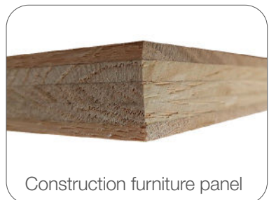
Construction furniture panel