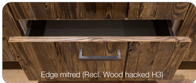
Edge mitred (Recl. Wood hacked H3)