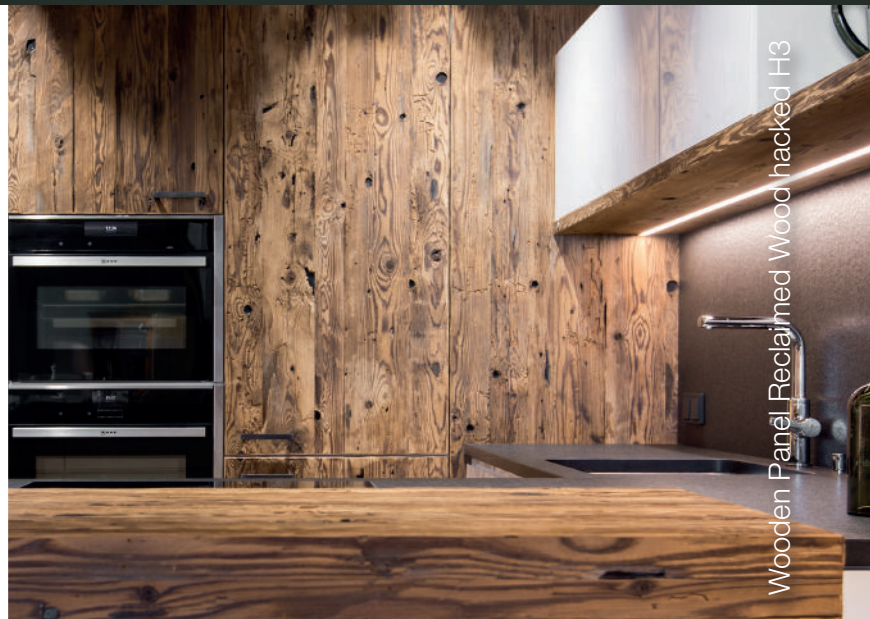
Wooden Panel Reclaimed Wood hacked H3

Room concepts made of natural wood for floors, walls & ceilings