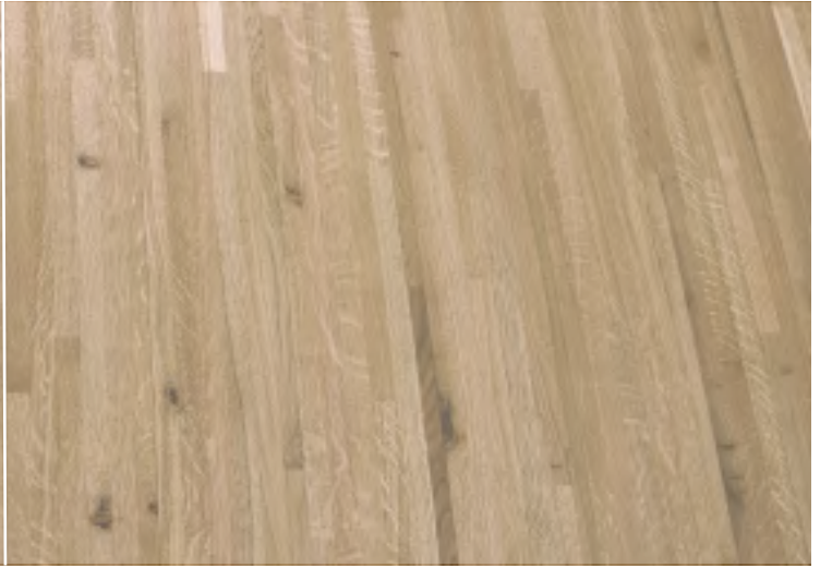
natural oiled easy care