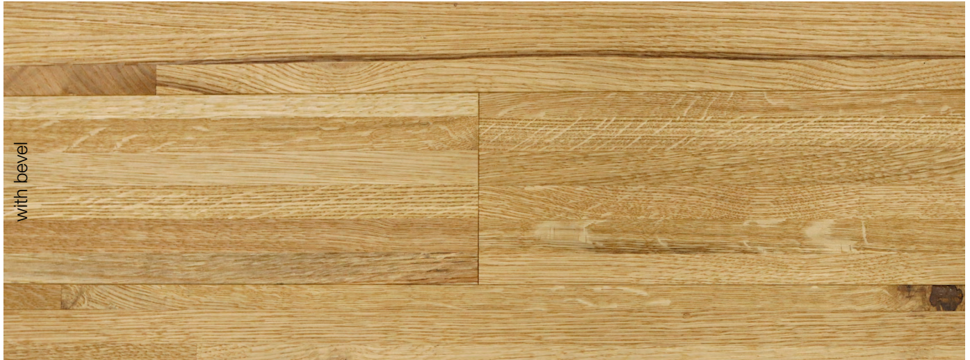
natural oiled easy care