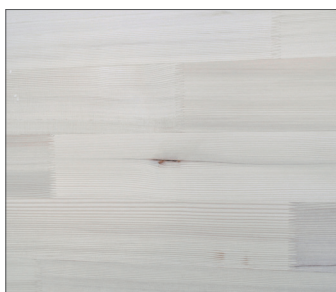
Top layer and backing