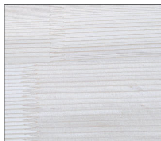
Top layer and backing

The above picture shows an example of the natural character of the wood, this will vary in every panel.