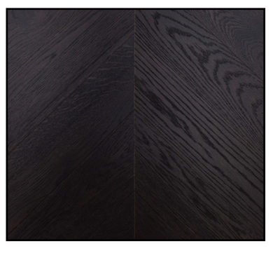
Chamfer with initial care